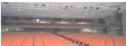
St. Mary's Auditorium

St. Mary's Auditorium, St Mary's College of Pharmacy, St. Francis Street, Secunderabad -500025 Telangana